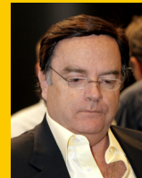
„José Salema Memorial“